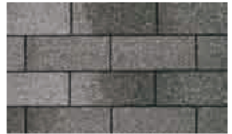
NW Harvard Slate